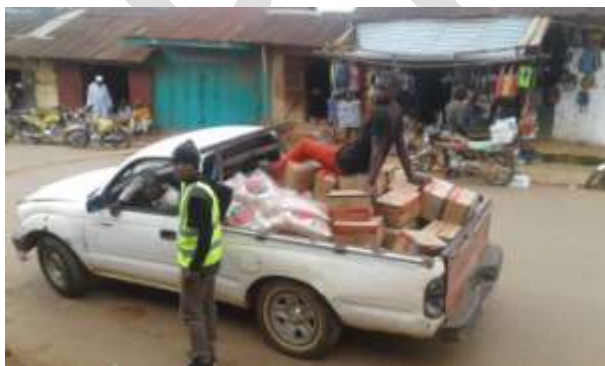
Some procured items