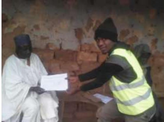
Handing over items at Tunga Danmaina