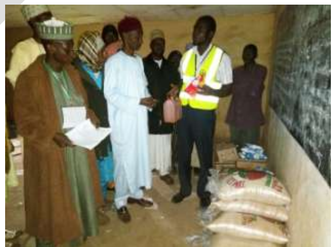
Handing over items at Nguroje