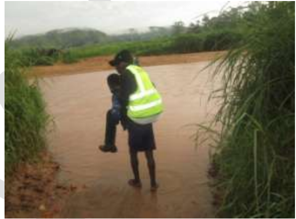
RHEMN Team accessing difficult areas