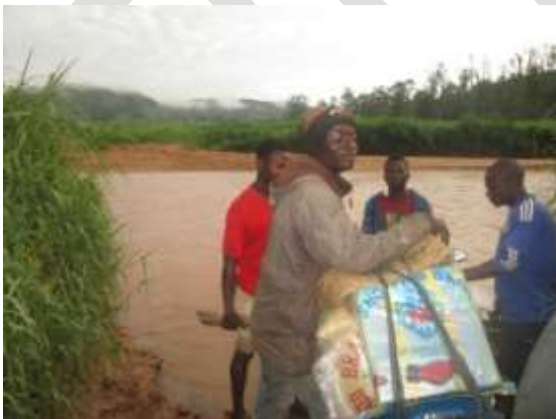
With camp coordinator at Nguroje