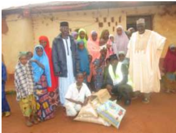
Item delivery for Njawai