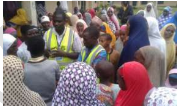
Listening to victim's problems