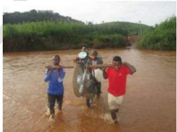
Crossing yana river