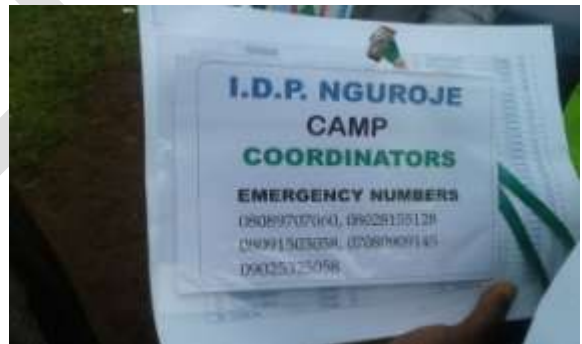
Nguroje IDP Emergency contact