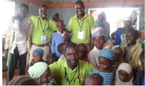
RHEMN Medics with some IDPs