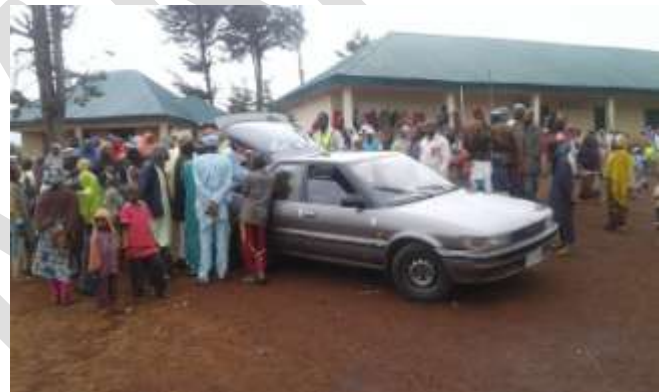
Item delivery at Nguroje