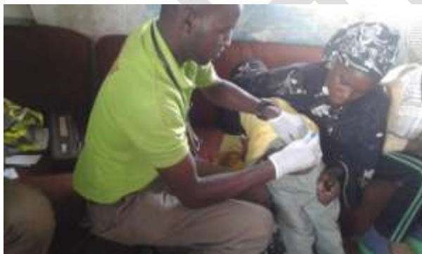
RHEMN Medical team at Emir's Palace