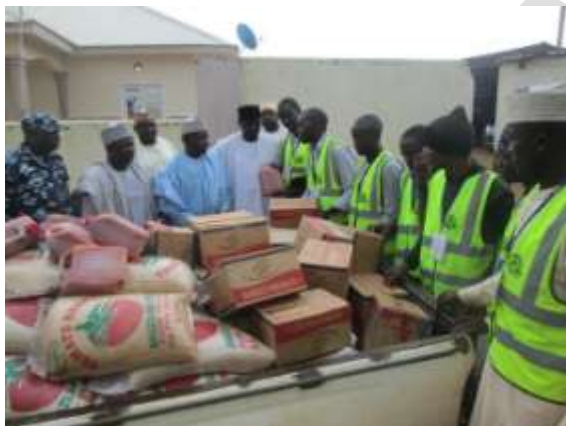
Presenting items at Emir's palace